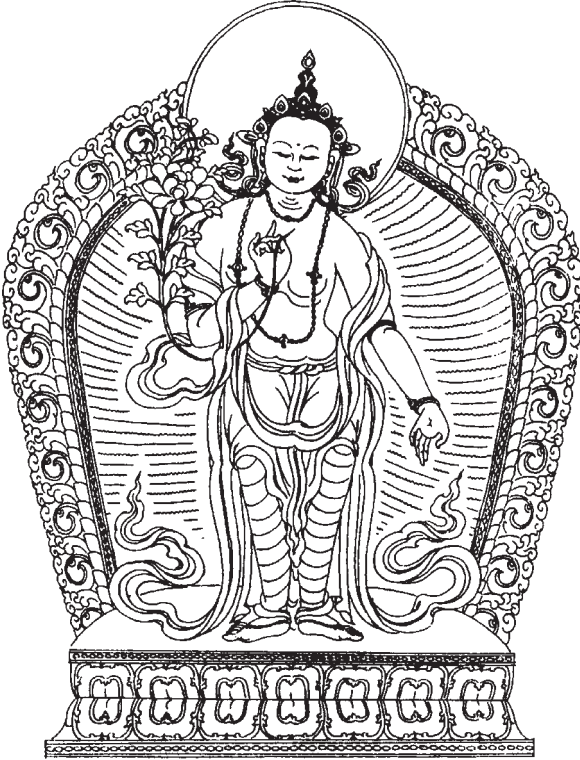
Samantabhadra One of the eight close bodhisattva disciples of the Buddha woodblock print